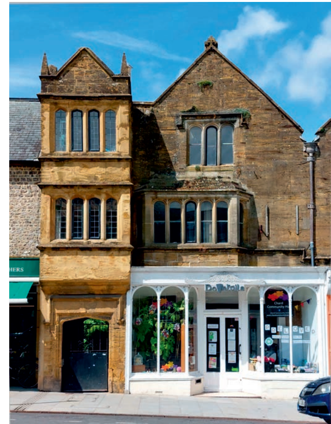
No 9 Fore Street, Chard, with a common entrance (left).

ABOVE: The white shop front currently 'The Hub - A Community Service Company'. No 9 is a Listed Grade 1 Elizabethan town house with first floor Courtroom containing a heavily decorated plaster ceiling all set behind this 'L' shaped three storey building.