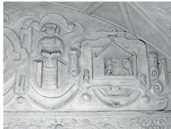
ABOVE: Part of the decorative panel in the Courtroom.

Local Film Company has commenced regular short film production - Episode 1 released June 2023 on YouTube.